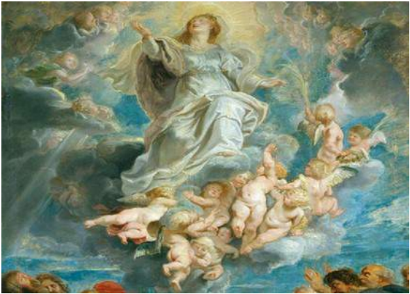
Aug. 15 The Assumption Of The Blessed Virgin Mary