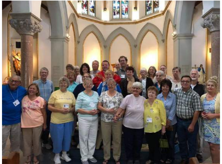
St. Joseph Pilgrims 2019 (Shrines of Eastern Canada)