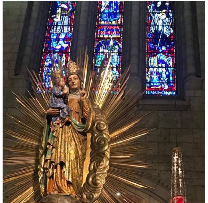
St. Anne de Beaupre, Pray for Us!