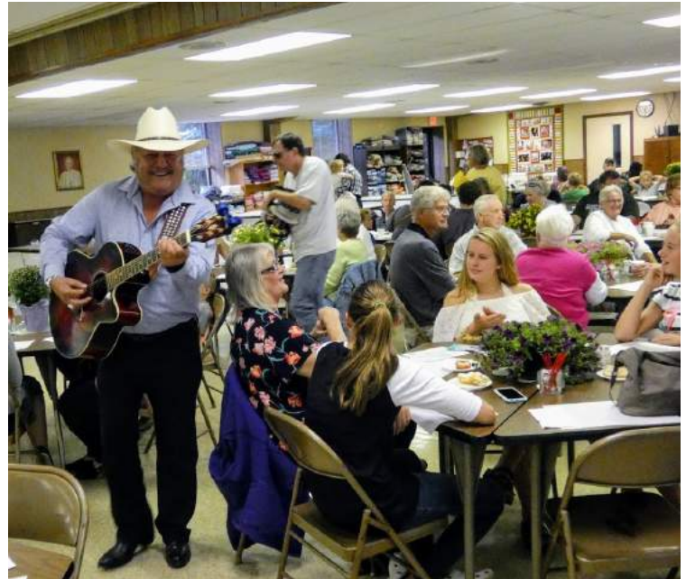
More pictures of the outdoor Mass can be seen on the website. www.stisidorechurch.org