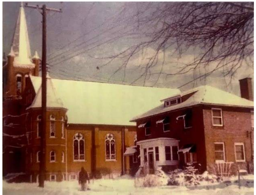
St. Isidore Church (1902- 1966) and Rectory (1910)