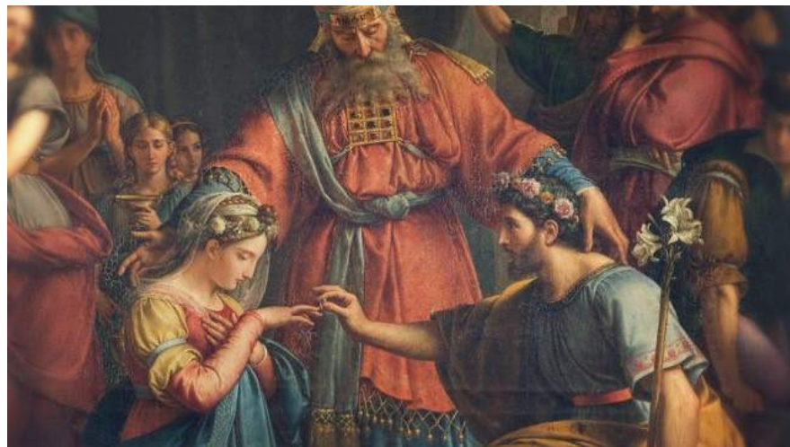
Imagine the life of Mary and Joseph before the first Christmas.