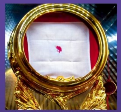
THE EUCHARISTIC MIRACLE OF SOKOLKA

MON · APRIL 17, 2023 Lansing Catholic High School