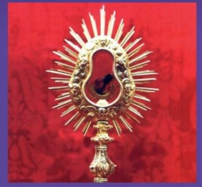
THE EUCHARISTIC MIRACLE OF SANTARÉM