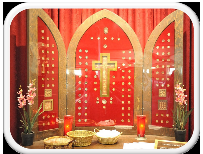
Altar of Relics

In the Lower Basilica, one may prayerfully visit altars dedicated to many saints. On the east side of the Lower Basilica, a display of the Holy Relics can be found. In Here are several first class relics of saints offered for veneration.