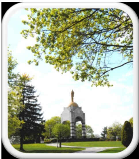
Shrine Park Memorial Altar

Located two blocks west of the Basilica is the Shrine Park. In this thirty-acre park can be found the outdoor Stations of the Cross, the impressive Memorial Altar dedicated to the war dead, as well as several white marble statues. In the Park, the visitor is once more in an atmosphere of peace and quiet for reflection and prayer.