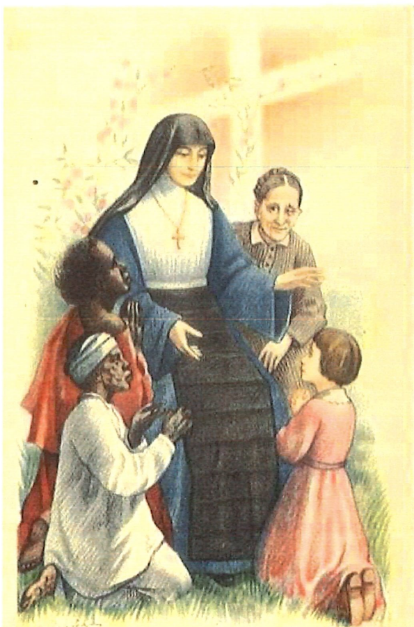
VENERABLE ANA-MARIA JAVOUHEY Fundadora de las Hermanas de San José de Cluny 1779-1851 Made in Italy www.todocoleccion.net