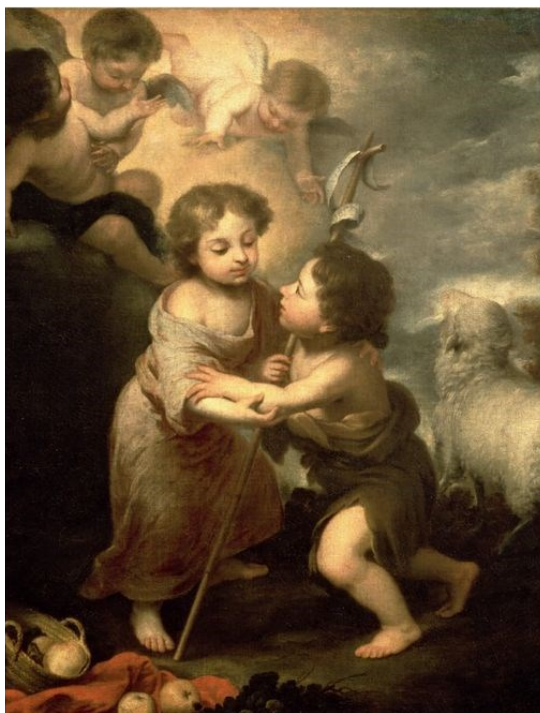
The child John the Baptist greeting the Christ child.

Today's Readings: Is 40:1-5, 9-11 (5b) Ps 85:9-10, 11-12, 13-14 2Pt 3:8-14 Mk 1:1-8