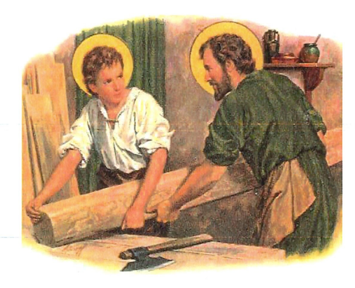
St. Joseph, pray for us!

Protector of Holy Mother Church, pray for us!