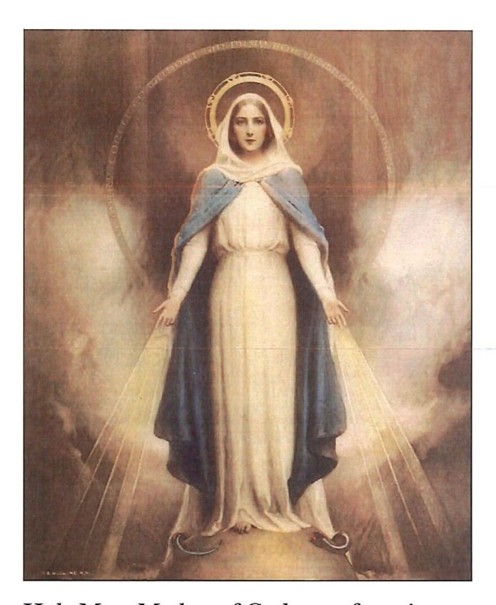
Holy Mary Mother of God, pray for us!

O Mary conceived without sin, pray for us who have recourse to thee!