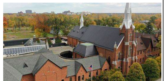
The Blessed Solanus Casey Center in Detroit

The Catholic Church has long encouraged pilgrimages to strengthen the spiritual experience of individuals, families, and even entire countries. We hope you can join us in April to the Solanus Casey Center in Detroit and the National Shrine of the Little Flower in Royal Oak. More details to follow in the bulletin and on our Facebook page.