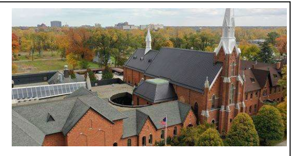
The Blessed Solanus Casey Center in Detroit

We hope you can join us in April to the Solanus Casey Center in Detroit and the National Shrine of the Little Flower in Royal Oak. More details to follow in the bulletin and on our Facebook page.